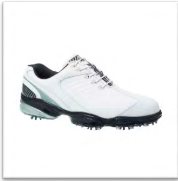
Footjoy Shoes, new in for 2010