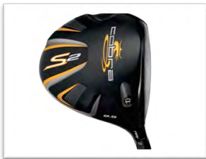
Cobra Golf, new in for 2010