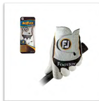
Footjoy Gloves, new in for 2010

Custom fitting: I believe that having a correct custom fitting for your clubs is vitally important to making sure you get the best possible results from your clubs. I will be offering a custom fit on all the equipment in the shop, which include, Drivers, Fairways woods, Irons, Wedges and most importantly Putters and just remember that if you buy any of the products you have been custom fitted for the fitting will be for FREE . So whether you are looking to update your own clubs or invest into a new club, please get fitted.